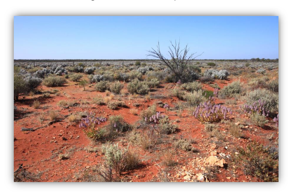
Stuart Highway Desert Flowers

This stage started on 13 September 2017.