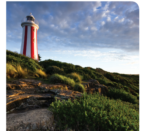
Mersey Bluff Lighthouse