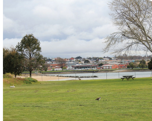
Camping ground at East Devonport

No form of "camping" is permitted in any of Devonport's reserves, parks and gardens (including car parks) between the hours of 10pm and 6am.