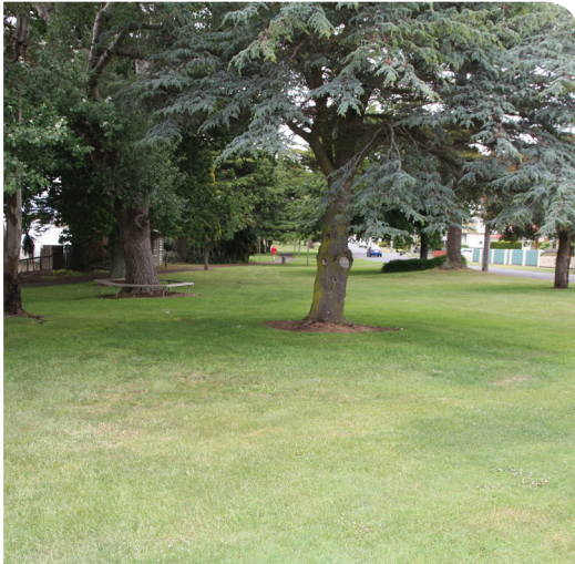
Camping is not permitted in any reserves, parks & gardens

The by-law defines "camping and includes tents, camper trailers, portable shelters, caravans, campervans, mobile homes or similar vehicles". It also includes sleeping in the open or in a vehicle.