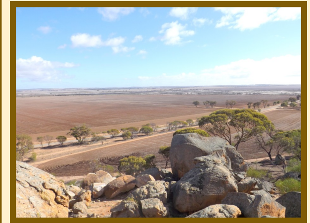
MT. STIRLING AND KOKERBIN ROCK