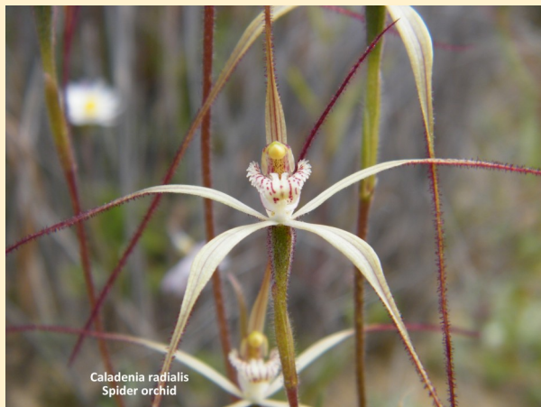
Caladenia radialis Spider orchid

USEFUL PHONE NUMBERS: LIFE THREATENING EMERGENCY - 000 SHIRE OF BRUCE ROCK - 90611377 SHIRE OF KELLERBERRIN - 90454006 SHIRE OF QUAIRADING - 96451001 DEPARTMENT OF PARKS AND WILDLIFE - 90416000